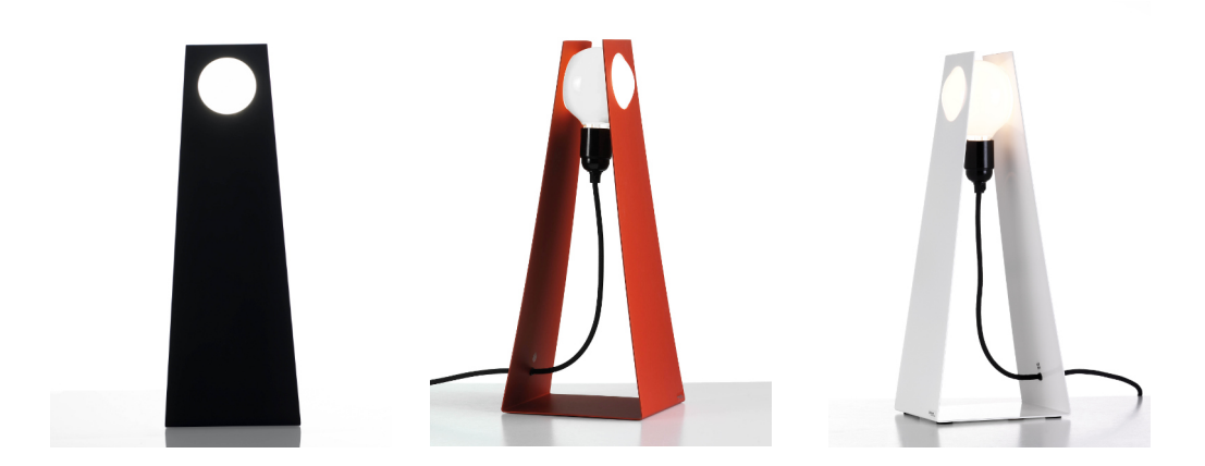
Table lamp made of lacquered aluminium, making it a striking element in any living space. With the bold graphic profile, the number of components used has been reduced to an absolute minimum. Black flex in fabric with switch. Bulb included